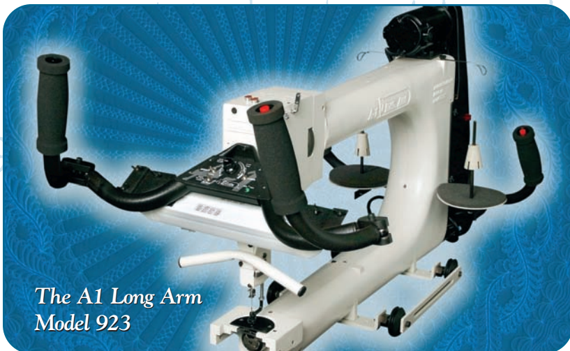
The A1 Long Arm Model 923

Another A1 'LITTLE THING'... Ergo-Grip Optional Feature- Multi-positional, any direction handles! "Your comfort level... at all times".